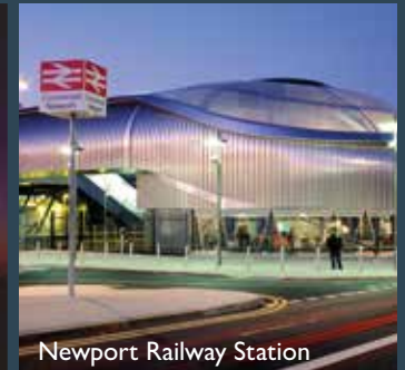
Newport Railway Station