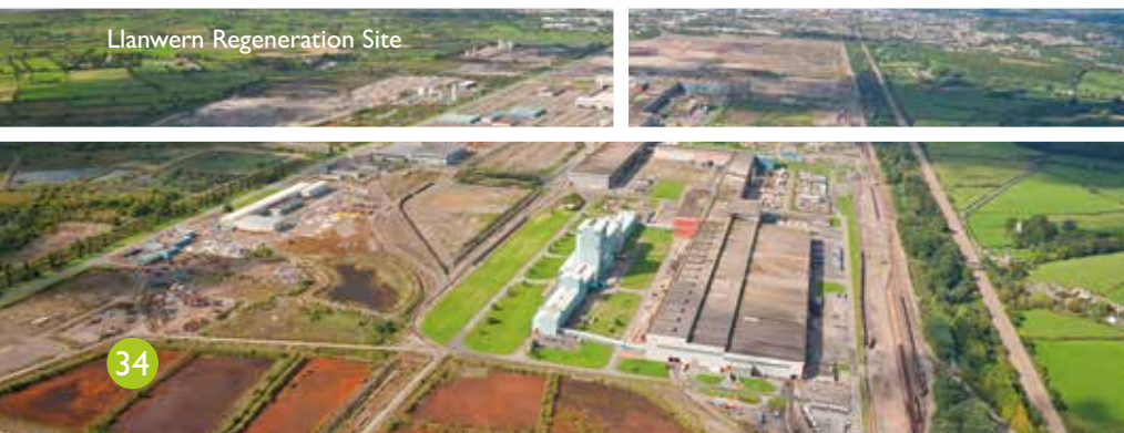
Llanwern Regeneration Site