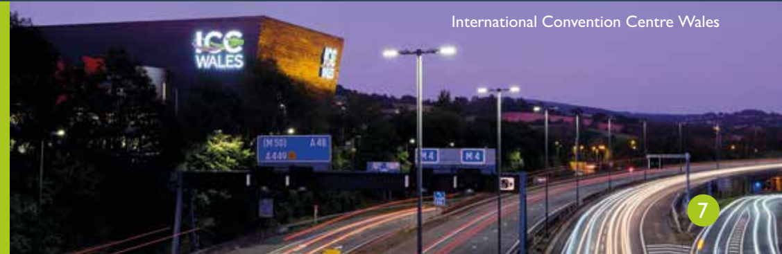
International Convention Centre Wales